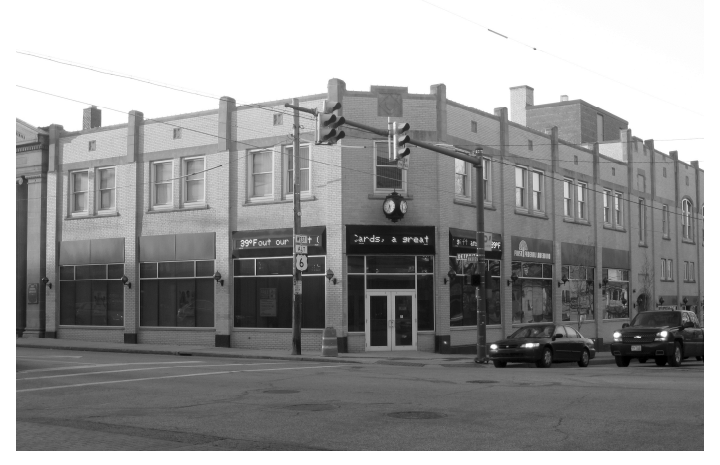
14800-06 Detroit Avenue 2012. The same basic building after numerous modifications still stands there today.