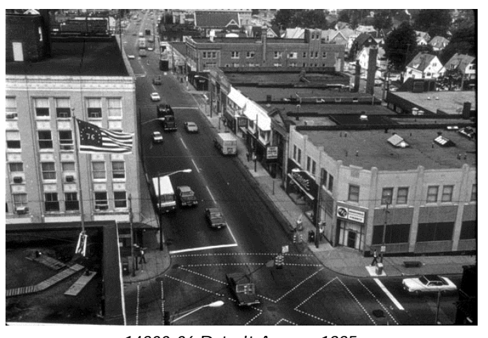
14800-06 Detroit Avenue 1985.