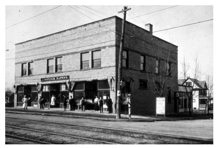
Lakewood Market