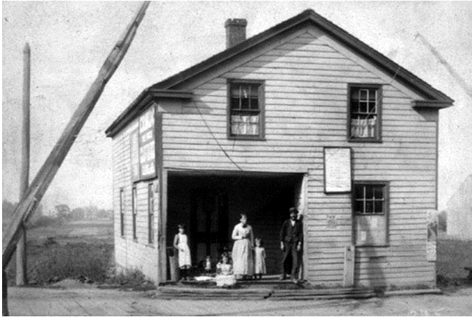
Detroit-Warren Toll Booth