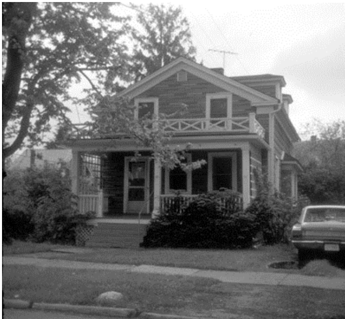
Former Detroit-Warren Toll Booth relocated to 1325 Cook Avenue. Porch and dormers added in the conversion to a residence.