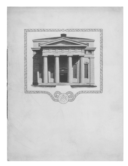
1916 Dedication Program Cover

Ninety five years ago this September our Lakewood Masonic Family was putting the finishing touches on plans for the formal dedication ceremony for our newly constructed Lakewood Masonic Temple by the Most Worshipful Grand Lodge of Ohio on the evening of Saturday, September 30, 1916, followed by a week long series of Grand Opening events.