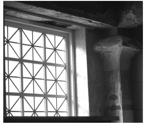
New 2010 Windows

We are delighted to report that, as this issue went to press, our 29 new Lodge Room Balcony level windows have just been installed. We call this a “back to the future” project for two reasons. First, we have restored the original historic appearance of this set of windows by returning to the original 1916 leaded glass configuration, the original leaded units having been replaced by glass squares several decades ago. Second, our original steel-frame windows have now been replaced with modern, energy efficient windows.