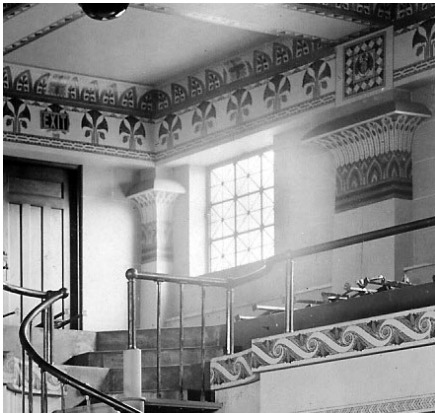
Original 1916 Windows